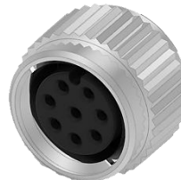
M8, 8P Female