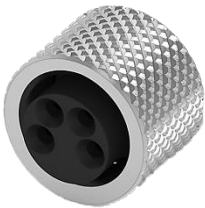
M8, 4P Female