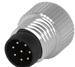
M8, 8P Male