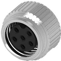
M8, 6P Female