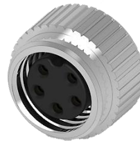
M8, 5P Female